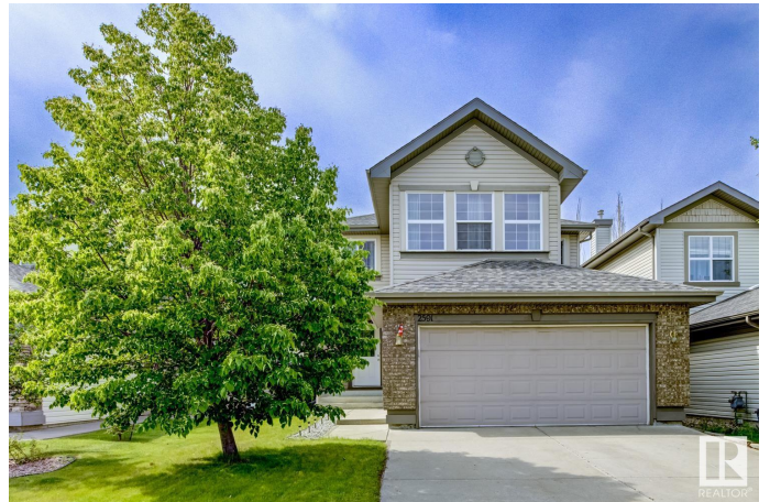
2591 Hanna Crescent NW